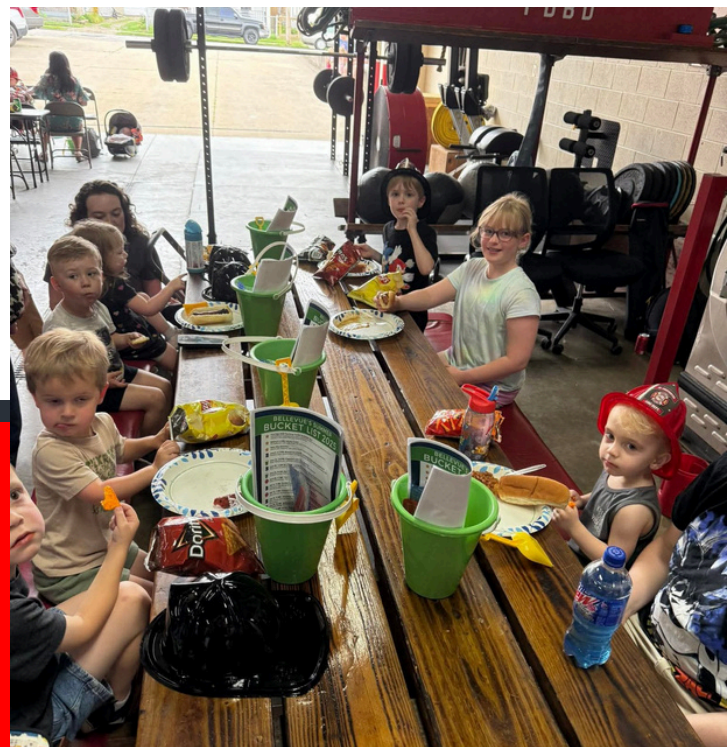
Right: Kids participating in the Bucket List Challenge at the Fire Station.